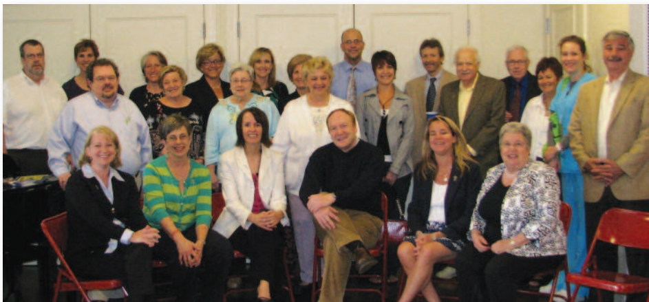
LCA KY/So. IN Chairs, Advisory Board Members and volunteers at the kick off.

We could not be more honored to have such a dedicated group of advocates engaged and committed to advancing LCA's unique mission. Great things are happening with this chapter and we are just getting started! For more information go to the chapter web pages: www.lungcanceralliance.org/kentucky . ■